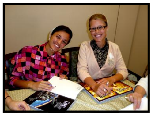
Happy Helpers Serving Jesus

It caused me to think more about the lives of people who are locked out of society and to yearn for the life, love, and peace of the Lord